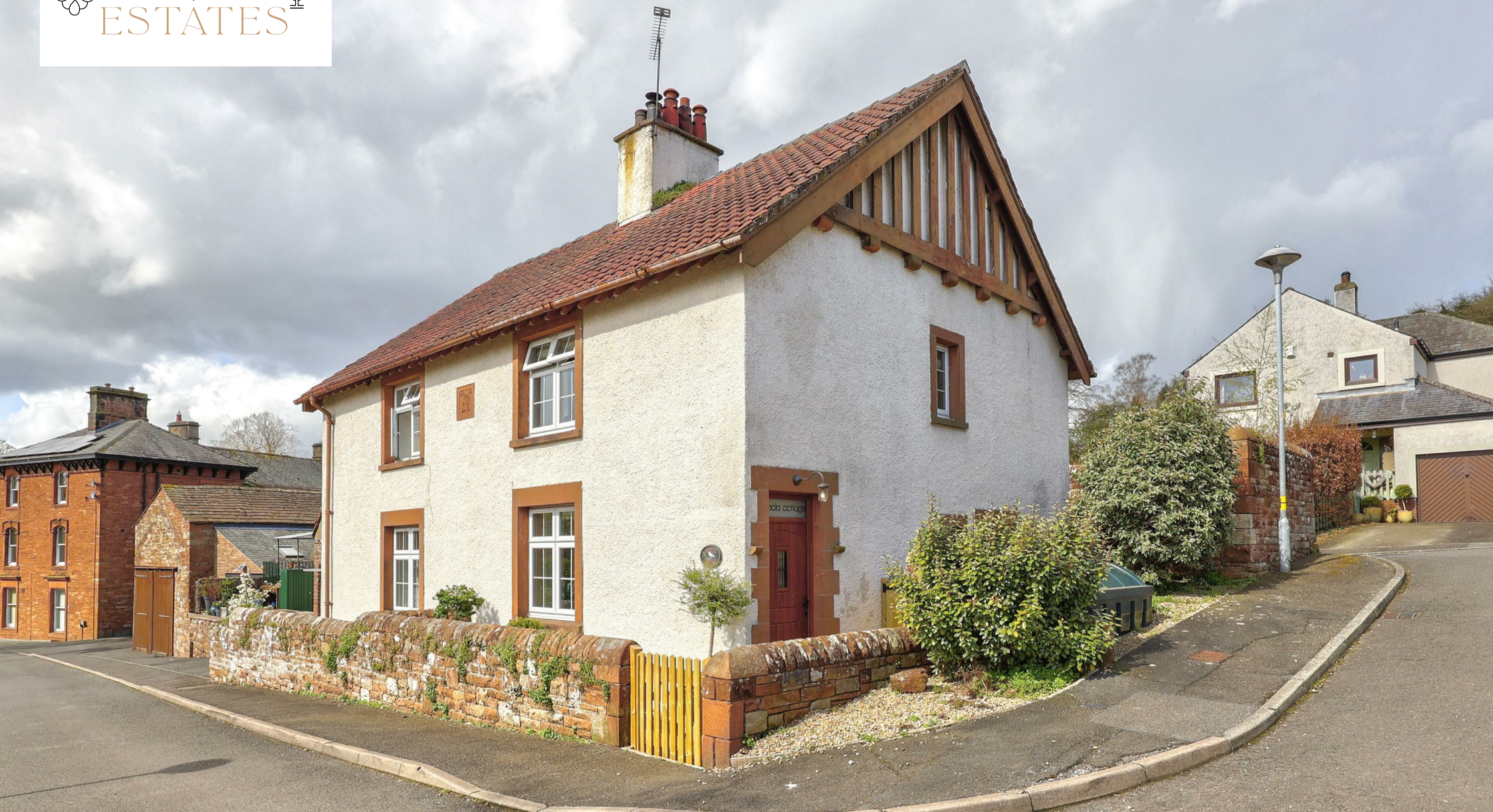
Acacia Cottage 1 Ravenshyll, Penrith, CA10 1DQ